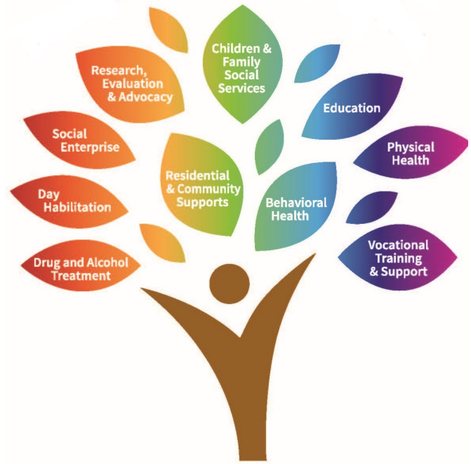
Woods for Life Continuum

Our strategic planning and growth are centered around the premise that through our continuum of services, an individual can receive supports from Woods for his or her lifespan as his or her needs change.